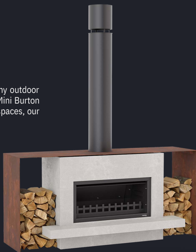
Model displayed with optional accessories