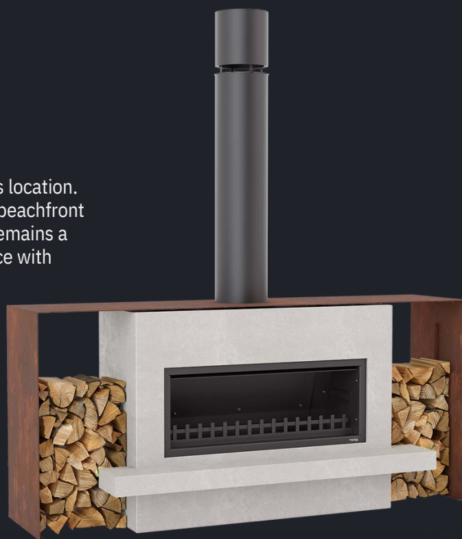
Model displayed with optional accessories